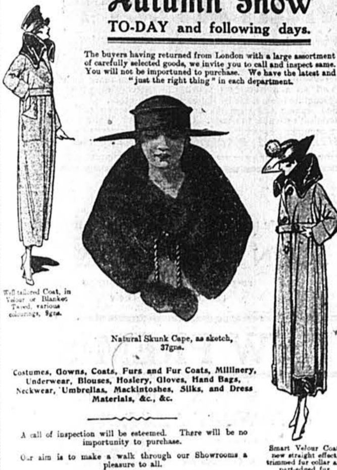
Natural Skunk Cape, as sketch, 37gns.

The buyers having returned from London with a large assortment of carefully selected goods, we invite you to call and inspect same.